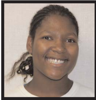
A Writer's Right

I write right 'cause I have the right to Just like you And the person next to you I also have the right 2 right the wrongs and Give these kids a new song Maybe even give them faith Faith and hope of a brighter day Because every person has something to say Just like the guy on that one day When he stood up to say I have a dream! He gave me faith to sing But until then I'll just stick to doing my thing Righting rights because I have the right to So thank you and good rights too